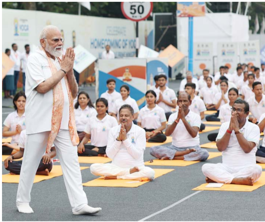
PM Narendra Modi participates in the 12th International Day of Yoga - 2026 celebrations at Kolkata.

Kolkata, June 21 (GNS): Prime Minister Narendra Modi, who led the 12th International Yoga Day event in Kolkata on Sunday, appreciated the participation of people from "all walks of life" while also emphasising the theme 'Yoga For Healthy Ageing'. In a post on X, PM Modi said: "An exceptional Yoga Day programme was held at Kolkata's Red Road this morning, in which people from all walks of life participated, giving an important message on the vitality of Yoga in everyone's lives." "This time, the theme was 'Yoga For Healthy Ageing' which emphasised the importance of Yoga in all ages to remain fit and healthy," he added. While addressing the