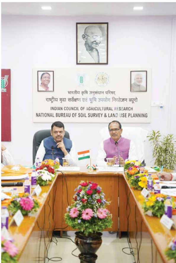
and state governments.